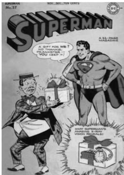
Figure 1.1 Superman's "X-ray vision" captures many people's intuitive beliefs regarding visual emissions.

In many respects, research on refutational messages mirrors the approach we're adopted throughout this book: first debunking the fictions about the mind and brain before unveiling the facts. As Mark Twain reminded us, learning often first requires unlearning.